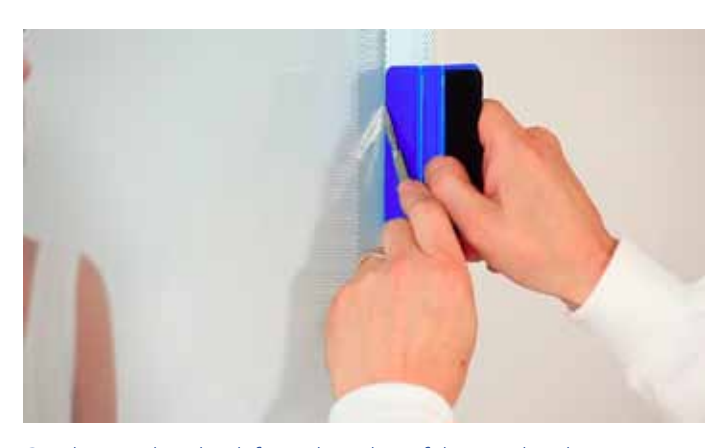
Cut the graphics back from the edge of the window by 1-3mm to ensure reliable edge adhesion.