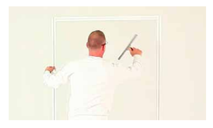
Complete a second cleaning using mild soap and water to ensure the window is completely clean.