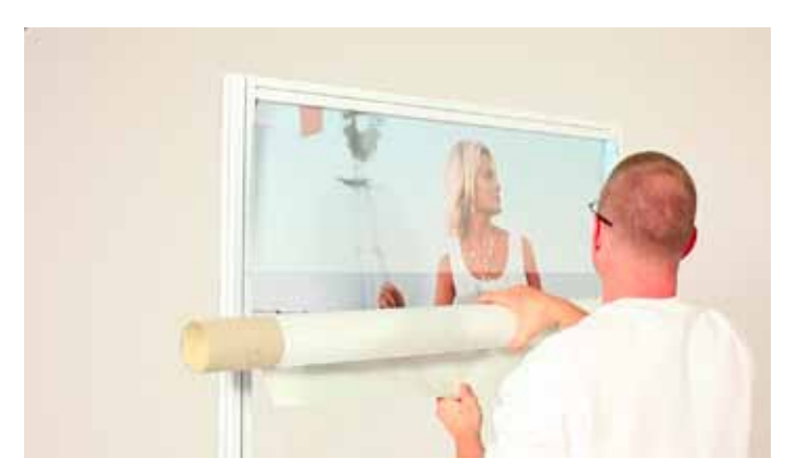
Start at the top - if your graphics are unlaminated, you can use a core to maintain tension.