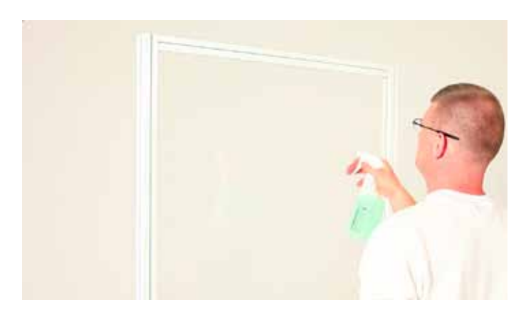
Surfaces to which the material will be applied must be thoroughly cleaned from dust, grease or any contamination that could affect the adhesion of the material.