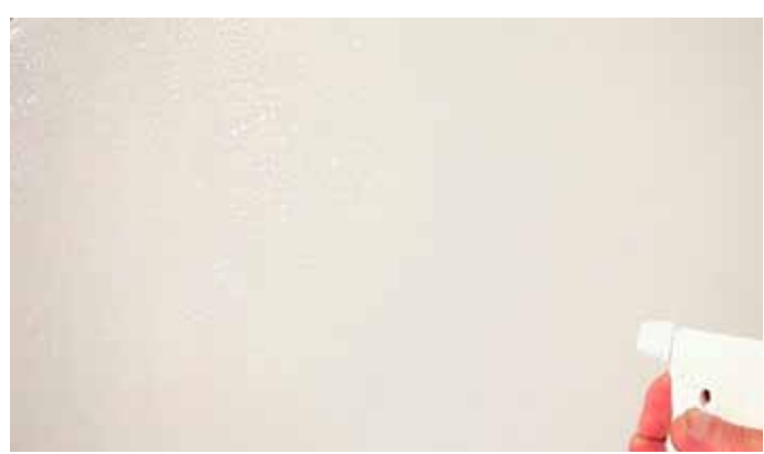
Finally, rinse with water only and thoroughly dry the surface.