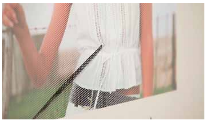
Remove the trimmed excess film to form a clean butt join.