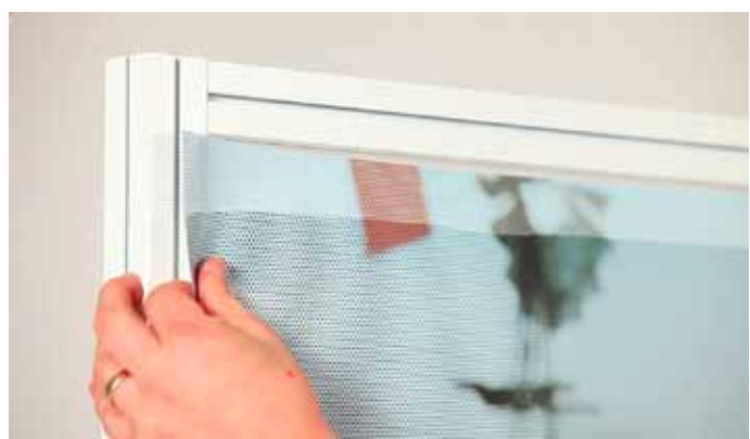
Begin application of material on the window.