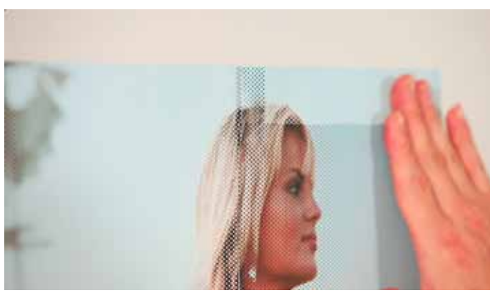
Take the second panel, cut away the top 25-50mm of the liner. Align the design of the first and second panels, applying second panel with overlap.