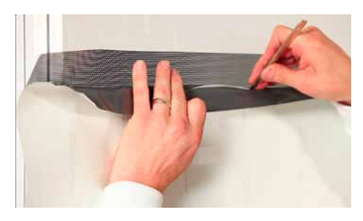
Apply dry using a plastic applicator with a low friction sleeve. Avoid touching the adhesive, especially at the edges and corners. Cut away the top 25-50mm of the liner.