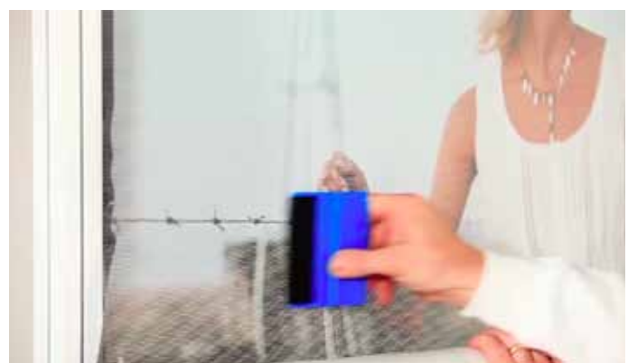
Otherwise, just squeegee down evenly, handling the graphic with care, and ensuring that no bubbles are trapped beneath the graphics.